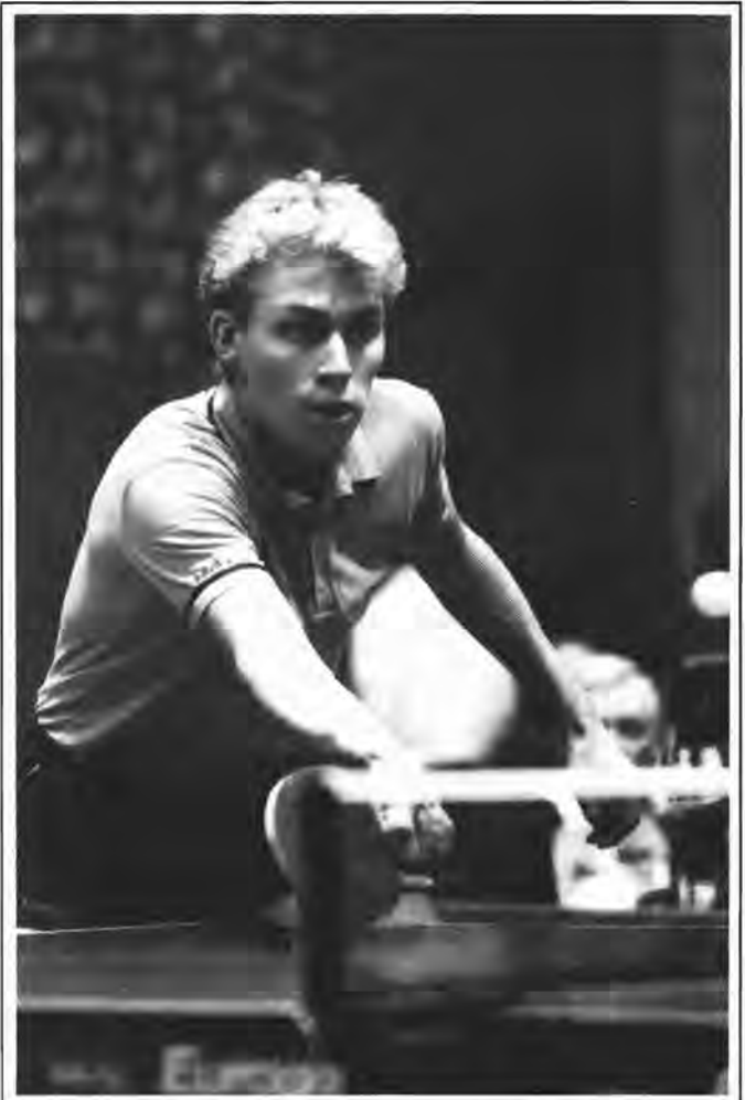
Sweden's world champion Jorgen Persson