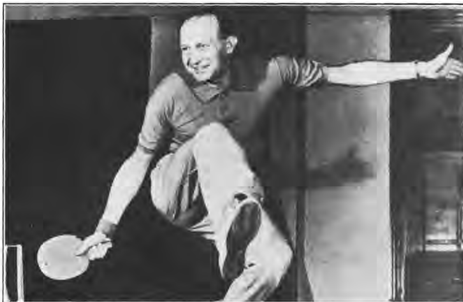
Acrobatic Victor Barna

The World Championships were actually held twice in the calendar year of 1933, the first in Baden, Austria, from 31st January - 5th February, and the second in Paris, France, from 2nd - 10th December. The latter event of course, was to cover the 1933-34 season. Hungary won nine out of the ten individual events and the Swaythling Cup on both occasions. It was in the Paris championships that a women's team competition took place for the first time and became known as the Corbillon Cup. Surprisingly, it was won by Germany who just beat the outstanding favourites from Hungary.